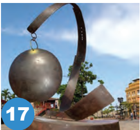
Deshove The release of fish eggs is defined as a large circle and its process in the form of curves re-creating a moment of fertilization. Downtown River Basin