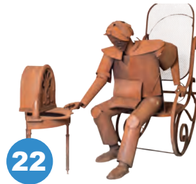
Sintonía A moment where time sits still and nothing else matters, depicting the nostalgia of passing time. Downtown River Basin