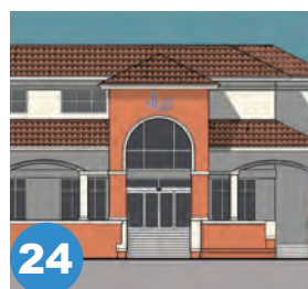
Allure Allure Condominiums Sales Gallery 1300 Hendry Street Fort Myers, FL 33901 www.AllureLuxuryCondominiums.com