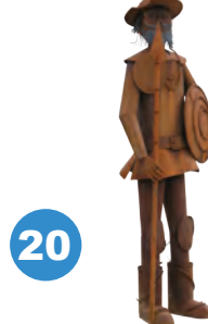
Don Quijote A tribute to the character Don Quixote incarnates: the utopian spirit of following one's own dreams. Greater Fort Myers Chamber of Commerce, Edwards Dr. at Lee St.