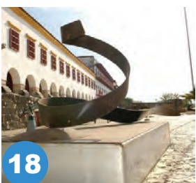
Anguila This sculpture is all about capturing the subtlety in the eel's movement. Downtown River Basin