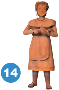
Vendedora de frutas One of the most emblematic characters of Cartagena de Indias is the palenquera a female fruit seller of San Basilio de Palenque. First St. at Monroe St.