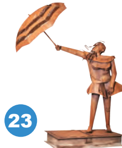
Brisas The artist takes advantage of the main character – wind – to add movement and test the woman's balance. Hendry St. at Allure Sales Gallery