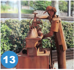
El vendedor de raspao The snow cone street vendor is an iconic character found in the landscape of Cartagena de Indias. First St. and Dean St.