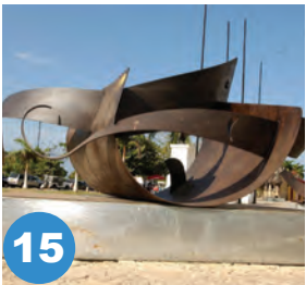
Apareo Resembling a symphony, this sophisticated piece re-creates the act of mating. Monroe St. at Harborside Event Center