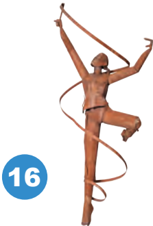
10.0 Balance, movement, and internal and external strengths come together to find a sublime moment. Downtown River Basin, Bay St. and Hendry St.