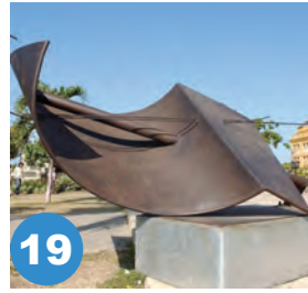
Nostalgia de cuerdas The artist discovers that the figurative can be reinvented with silence and space. Downtown River Basin